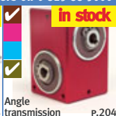
Angle transmission P.204