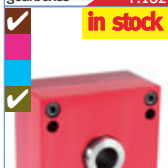
Bevel T gearboxes P.235