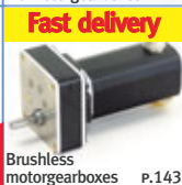
Brushless motorgearboxes P.143