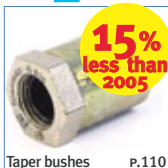
Taper bushes P.110