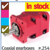
Coaxial gearboxes P.254