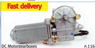
DC Motorgearboxes P.116