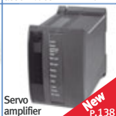
Servo amplifier P.138