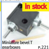
Miniature bevel T gearboxes P.221