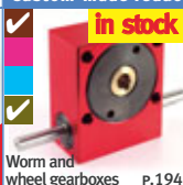
Worm and wheel gearboxes P.194