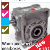
Worm and wheel gearboxes P.182