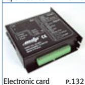
Electronic card P.132