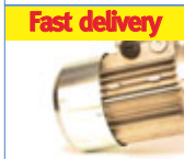
AC motorgearboxes P.149