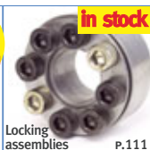
Locking assemblies P.111