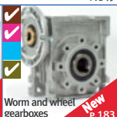
Worm and wheel gearboxes P.183