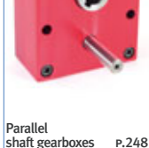
Parallel shaft gearboxes P.248