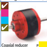
Coaxial reducer P.254